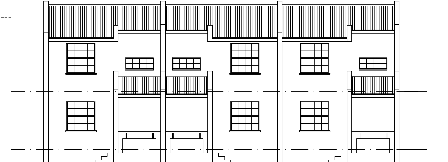
FRONT ELEVATION SCALE 1/8"=1'-0" 1:100